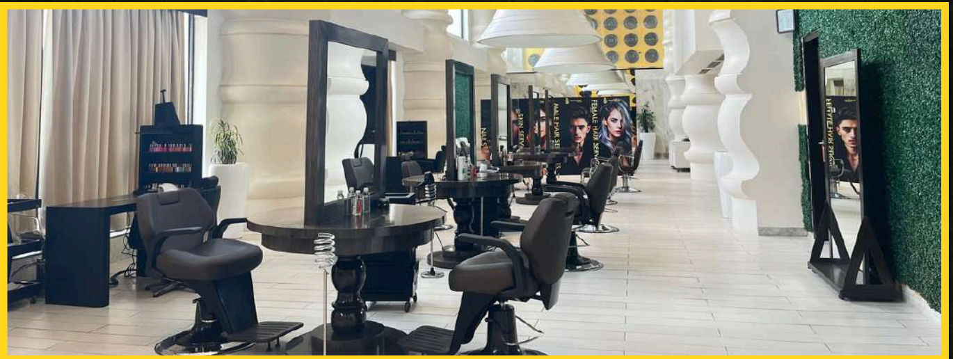
Club O7, Shela, India