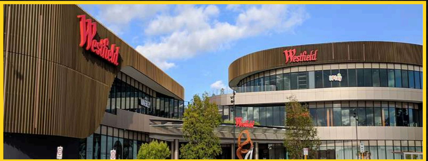
..... Westfield Carousel, WA, Australia .....