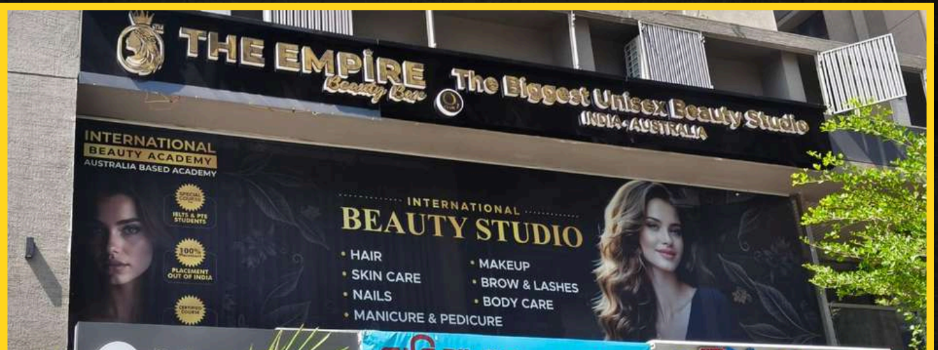
Shaligram prime, South Bopal, India