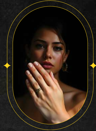
MANICURE & PEDICURE