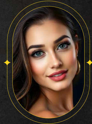
BROW & LASHES